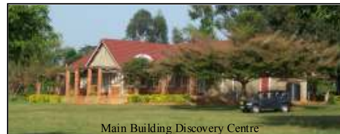
Main Building Discovery Centre