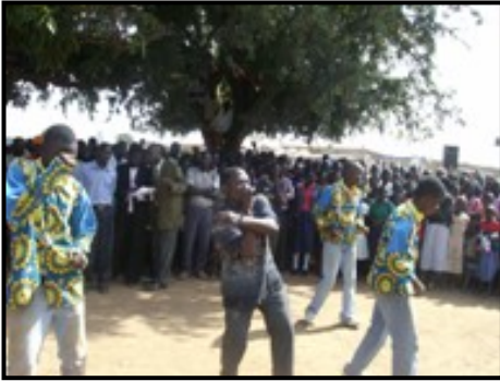
Members of the Arise and Shine Dance group performing in Pader

It has now been relatively peaceful in Northern Uganda for nearly two years, since the very troubled times when the rebel soldiers were active. Pader was one of the towns where the population from the surrounding villages sought refuge. Many have now returned home or moved to transit camps. The Discovery Centre team along with others from YWAM visited