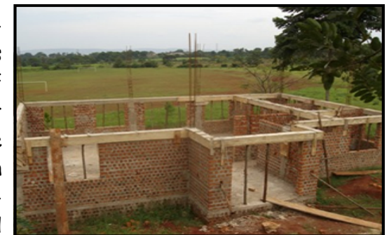
First Ring Beam Completed on the Education Centre

The Education Centre is progressing well. Construction has now reached the completion of the first ring beam. The next stage is the creation of the first floor concrete slab. Then follows the upper floor construction. Of the estimated £38,000 to construct the building, £26,000 has now